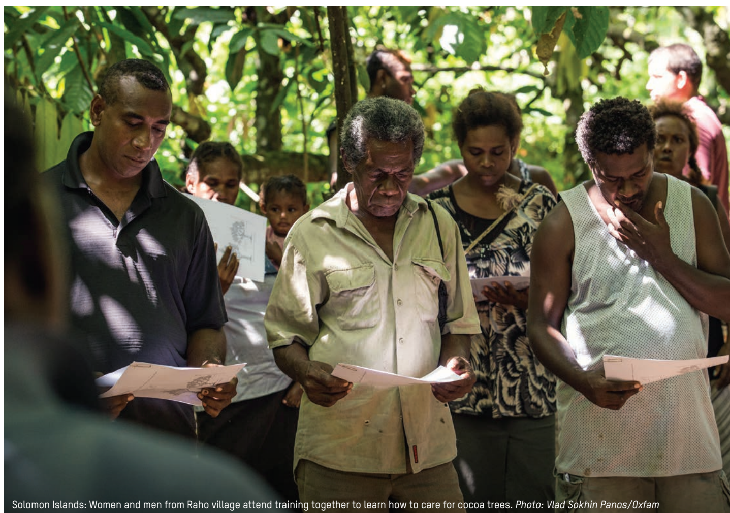
Solomon Islands: Women and men from Raho village attend training together to learn how to care for cocoa trees.

A detailed methodology, including limitations, is available from Oxfam.